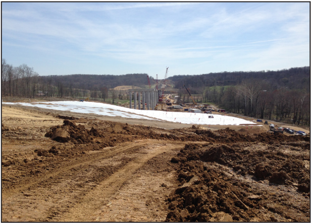
Part of I-69: Section 5

Infrastructure Engineering, Inc. was recently recognized on February 11th at the Engineering Excellence Awards Competition in Normal, IL for their Joint Venture project “WOOD STREET PHASE I” which was planned for the Illinois Department of Transportation. IEI earned a Merit Award given for those projects worthy of recognition for the engineer and the owner/client. In addition to the Merit Award, IEI also received recognition in Indianapolis and New York.